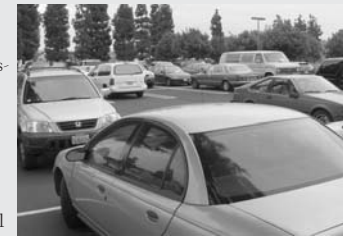
The new City of Industry Park and Ride highlights the growing need for commuter parking.

CNG fueling station at the Irwindale Operations Facility. Up until this year, all of our CNG buses were deployed out of the Pomona